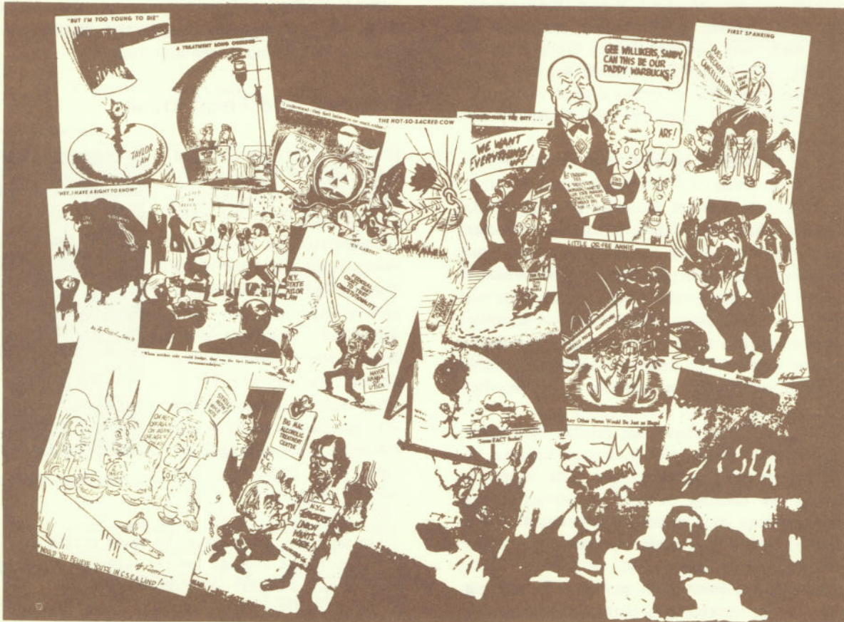
The Taylor Law and collective bargaining have been the subject of hundreds of cartoons over the years. Here's a sampling.

Public sector collective bargaining would appear to have provided public employees with more protection against inflation than in previous periods of inflation such as 1949-52. On the other hand, there is little indication that public sector employees made gains relative to their private sector counterparts.